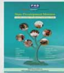
SDM - 4th week of every month

Trade and Investment Facilitator (TIF) aims to provide information on recent developments in India's foreign trade, foreign investments, policy developments, bilateral economic relations, trade agreements, WTO among others.