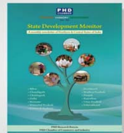
SDM – 4th week of every month

Trade and Investment Facilitator (TIF) aims to provide information on recent developments in India's foreign trade, foreign investments, policy developments, bilateral economic relations, trade agreements, WTO among others.