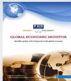
GEM -2nd week of every month

Economic Affairs Committee (EAC) issues a comprehensive newsletter on the economic and social developments in the economy in a particular month. The report provides a concise view of the movements in lead indicators in that month and in the coming times.