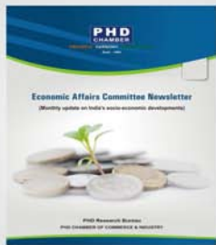
EAC - 1st week of every month

PHD Research Bureau of PHD Chamber of Commerce and Industry offers an opportunity to sponsor its well accepted four monthly e-newsletters: EAC, GEM, TIFS, and SDM.