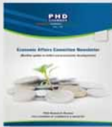
EAC - 1st week of every month

PHD Research Bureau of PHD Chamber of Commerce and Industry offers an opportunity to sponsor its well accepted four monthly e-newsletters: EAC, GEM, TIFS, and SDM.