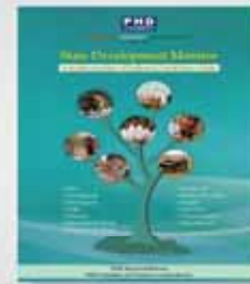
SDM - 4th week of every month

Trade and Investment Facilitator (TIF) aims to provide information on recent developments in India's foreign trade, foreign investments, policy developments, bilateral economic relations, trade agreements, WTO among others.