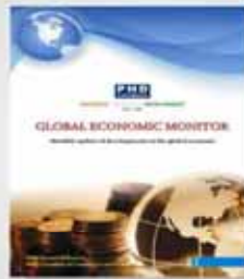
GEM -2nd week of every month

Economic Affairs Committee (EAC) issues a comprehensive newsletter on the economic and social developments in the economy in a particular month. The report provides a concise view of the movements in lead indicators in that month and in the coming times.