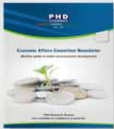
EAC - 1st week of every month

PHD Research Bureau of PHD Chamber of Commerce and Industry offers an opportunity to sponsor its well accepted four monthly e-newsletters: EAC, GEM, TIFS, and SDM.