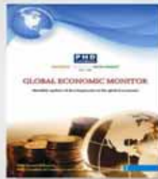
GEM -2nd week of every month

Economic Affairs Committee (EAC) issues a comprehensive newsletter on the economic and social developments in the economy in a particular month. The report provides a concise view of the movements in lead indicators in that month and in the coming times.