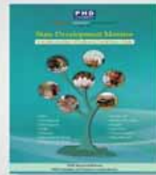
SDM - 4th week of every month

Trade and Investment Facilitator (TIF) aims to provide information on recent developments in India's foreign trade, foreign investments, policy developments, bilateral economic relations, trade agreements, WTO among others.