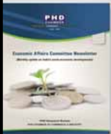
EAC - 1st week of every month

PHD Research Bureau of PHD Chamber of Commerce and Industry offers an opportunity to sponsor its well accepted five monthly e-newsletters: EAC, FOREX, GEM, TIFS, and SDM.