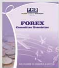
FOREX - 1st week of every month

Economic Affairs Committee (EAC) issues a comprehensive newsletter on the economic and social developments in the economy in a particular month. The report provides a concise view of the movements in lead indicators in that month and in the coming times.