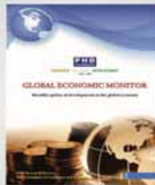
GEM - 2nd week of every month

Forex Committee Newsletter provide a broad view of developments related to forex affairs of our economy such as rupee movement, forex reserves, regulatory developments, stock markets behaviour, interest rate scenario, commodities overview and key macroeconomic indicators etc.