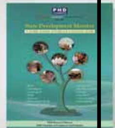
SDM - 4th week of every month

Trade and Investment Facilitator (TIF) aims to provide information on recent developments in India's foreign trade, foreign investments, policy developments, bilateral economic relations, trade agreements, WTO among others.