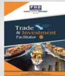
TIFS - 3rd week of every month

Global Economic Monitor (GEM) aims to disseminate information on latest updates on global macro-economic indicators including growth, inflation, trade, markets, commodities, unemployment, policy developments and publications of international organization