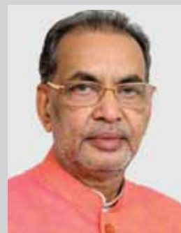
Shri Radha Mohan Singh Hon'ble Union Minister for Agriculture & Farmers Welfare