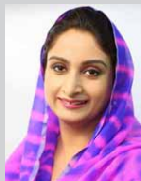
Smt. Harsimrat Kaur Badal* Hon'ble Union Minister for Food Processing Industries