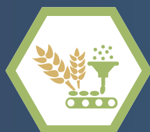
Agriculture & Food Processing