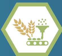
Agriculture & Food Processing

10 th December, 2020 Hotel Le-Meridien, New Delhi