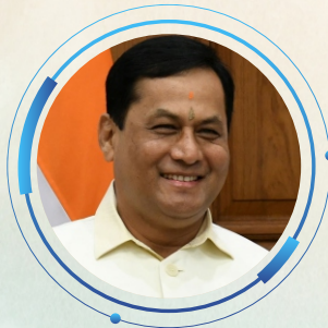
SHRI SARBANANDA SONOWAL

Hon'ble Union Minister for Commerce and Industry