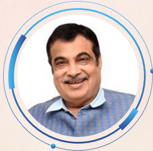
SHRI NITIN JAIRAM GADKARI

Auditorium 2 - Bharat Mandapam, Pragati Maidan, New Delhi – 110001