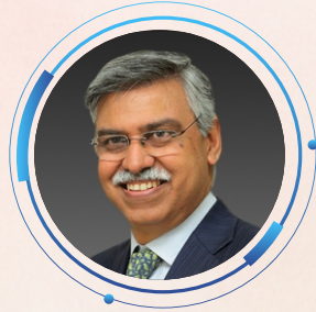
SHRI SUNIL KANT MUNJAL

Auditorium 2 - Bharat Mandapam, Pragati Maidan, New Delhi – 110001