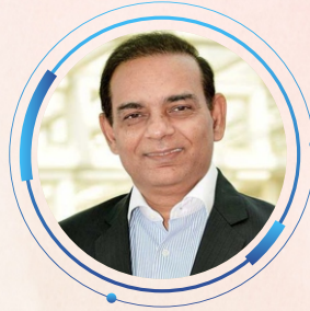
SHRI MOTILAL OSWAL