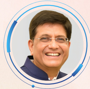
SHRI PIYUSH GOYAL

Hon'ble Union Minister of Road Transport & Highways