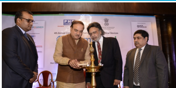
PharmaMed 2015 Lightning by Shri Ananth kumar* Hon'ble Union Minister of Chemicals & Fertilizers