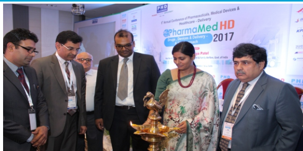
PharmaMed 2017 Lightning by Smt. Anupriya Patel Hon'ble Minister of State, Ministry of Health & Family Welfare, Govt. of India