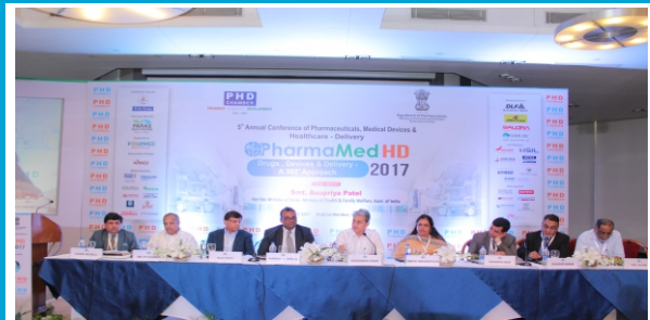
PharmaMed 2017 Shri Sudhansh Pant, IAS, Joint Secretary Department of Pharmaceuticals, Ministry of Chemicals & Fertilizers Govt. of India