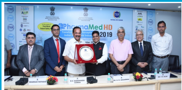
PharmaMed 2019 Presenting Memento to Chief Guest Shri. D V Sadananda Gowda, Hon'ble Union Minister Ministry of Chemicals & Fertilizers, Govt. of India