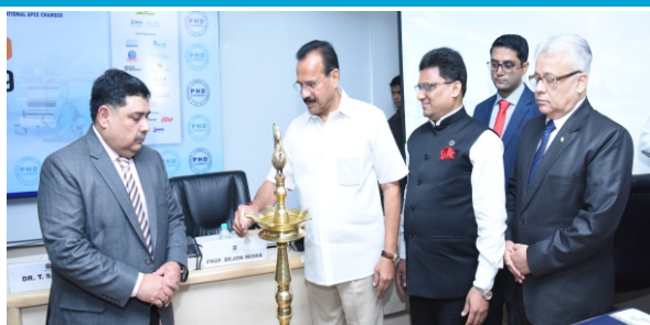
PharmaMed HD 2019 Lightning by Shri. D V Sadananda Gowda, Hon'ble Union Minister Ministry of Chemicals & Fertilizers, Govt. of India