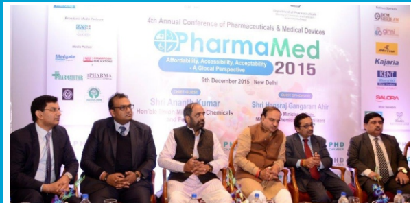
PharmaMed 2015 Lightning by Shri Ananth kumar* Hon'ble Union Minister of Chemicals & Fertilizers